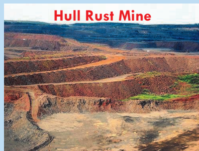
Hull Rust Mine