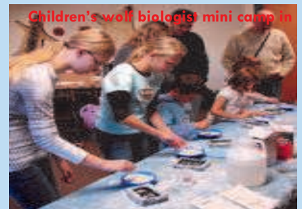
Children's wolf biologist mini camp in