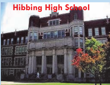
Hibbing High School